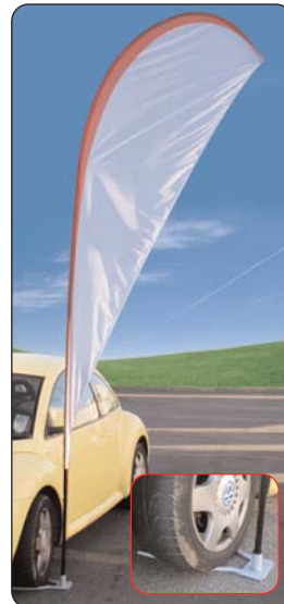
Drive-on Car foot option