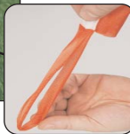
180mm fixing loop sewn to base of flag