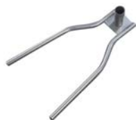
Drive-on Car foot