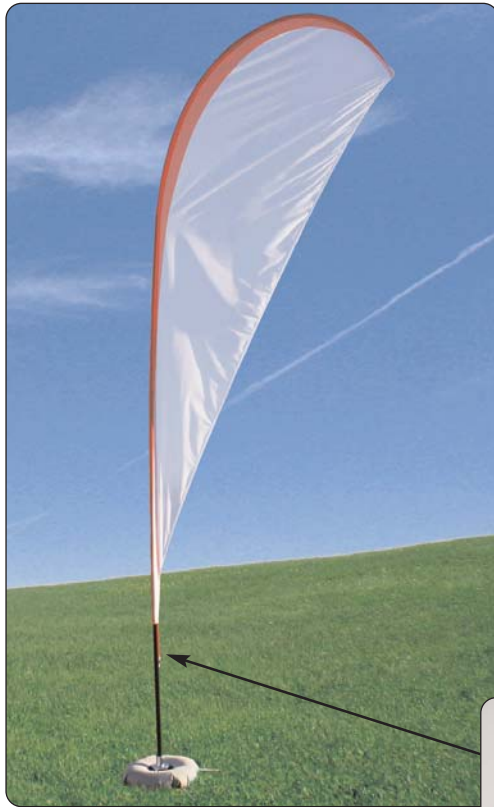
Weighting ring option