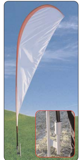
Ground stake option